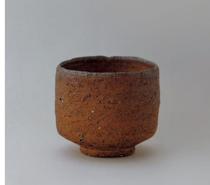
a cup by the artist Hiroshi Sugimoto

What emerges is less about ceramics themselves and more about creative translation: how ideas shift when material, scale, and process change. The exhibition ultimately invites visitors to see pottery not just as craft, but as a medium open to reinterpretation by anyone willing to experiment. The museum is located in Yokkaichi, a city known for its long-standing Banko-yaki ceramic tradition.