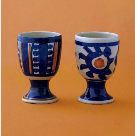
a pair of tumblers by the artist Taro Okamoto

What happens when some of Japan's most celebrated creatives step outside their usual disciplines and into the world of clay? That's the question at the heart of "The Other Ceramics," an exhibition currently on view at the BANKO Archive Design Museum in Yokaichi, Mie prefecture.