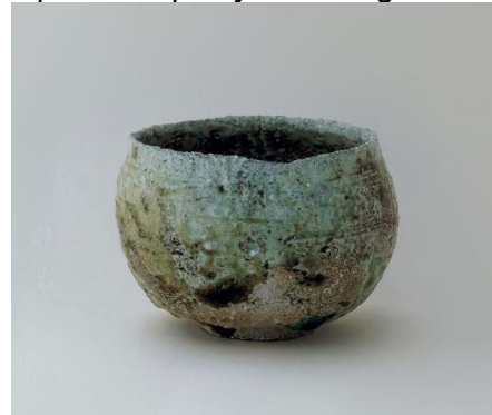
a cup by the fashion icon NIGO